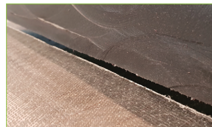
Fig. 3: Void analysis on a thick carbon fibre laminate infused in VAP® technology (IMA)